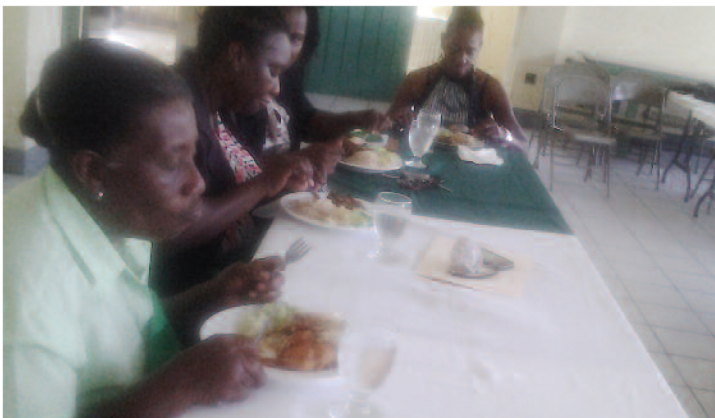
Foster parents being feted at a St. Thomas luncheon.