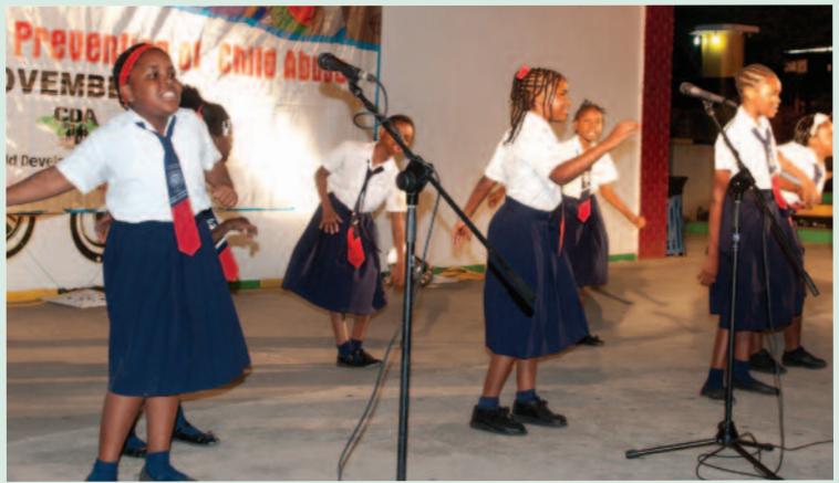
Allman Town Primary Entertains