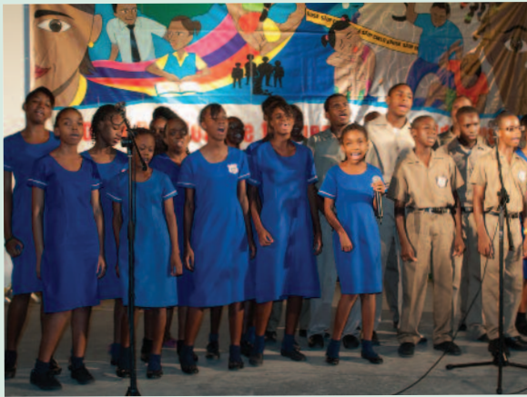
Salvation Army School for the Blind excites the audience with their beautiful voices.