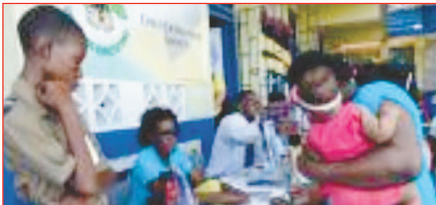
Parents acquiring information from the CDA officers at the Agency's booth while attending the recent 'Every Child is My Child Community Forum and Expo held at the Allman Town Primary School in Central Kingston recently. The event was held under the theme, "Parenting for Positive Change in Jamaica."

Exhibitors at the event included the CDA; the National Parenting Support Commission; the Office of the Children's Registry (OCR); CISOCA; HEART Trust/NTA; the National Council on Drug Abuse (NCDA); the Office of the Children's Advocate (OCA); Ministry of Labour, PATH the Broadcasting Commission, and Police Safety and Security, among others.