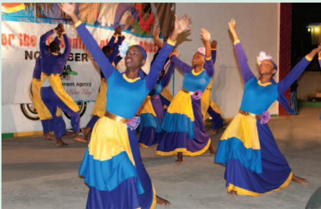
Ascott High school gives expression in dance.